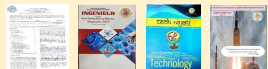
Magazines and Newsletters