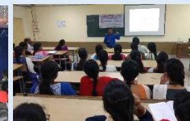
Guest Lectures and Value-Added Courses