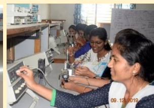
Microwave Engg. Lab