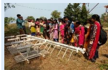
Industrial Visits at Doordarshan, RADAR station, ...