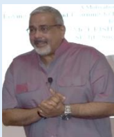
Krish Dhanam Skylife, USA