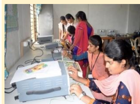
Electronics Lab 1