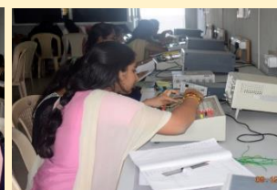
Electronics Lab 2