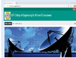
Learning Management System